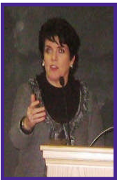
MA Coalition for Addiction Services Recovery Month Celebration 9/23/09