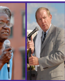
The Honorable Robert Ziemian, a Recovery Month Star, started MA Drug Courts to help build a structured path for recovery for people struggling with addiction and crime. It works!